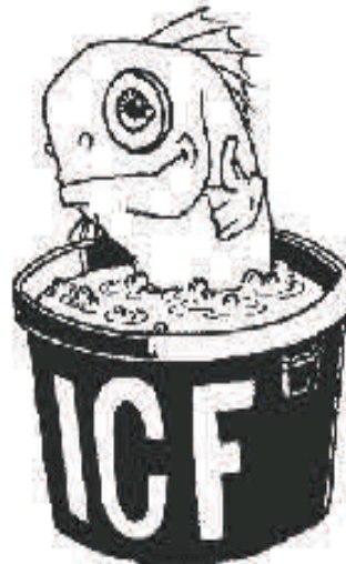
Fish & fries cooked in soybean oil.

Dinners also include French fries, homemade coleslaw and tartar sauce.